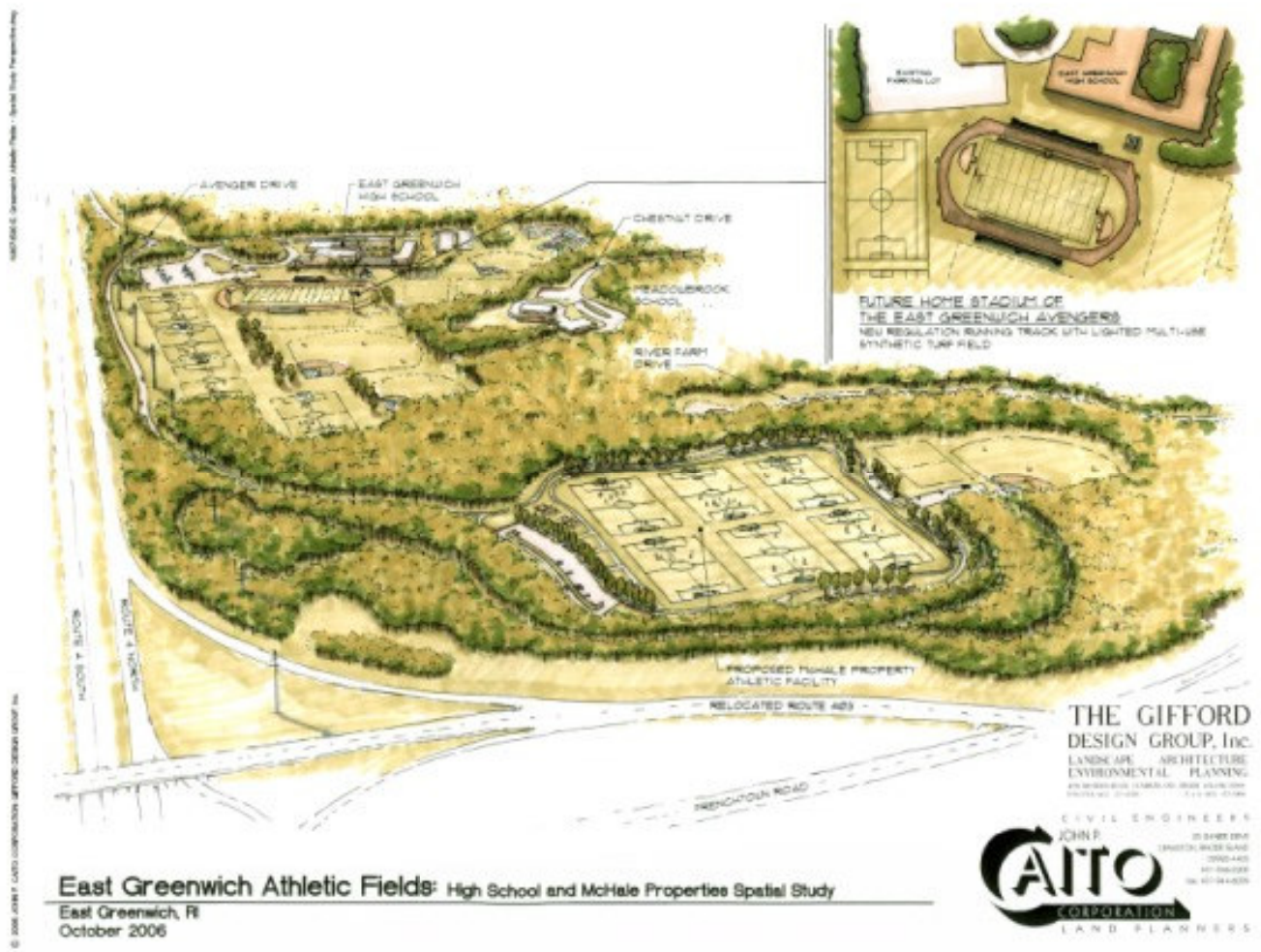
East Greenwich Athletic Fields: High School and McHale Properties Spatial Study East Greenwich, RI October 2006

THE GIFFORD DESIGN GROUP, Inc. LANDSCAPE ARCHITECTURE ENVIRONMENTAL PLANNING CIVIL ENGINEERS JOHN F. GIFFORD 1000 WOODLAND SUITE 200 EAST GREENWICH, RI 02816 TEL: 401-885-4400 FAX: 401-885-4400